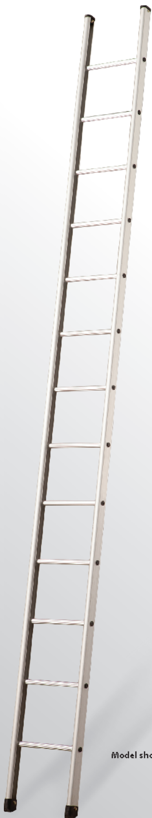
Model shown here is WR 1014